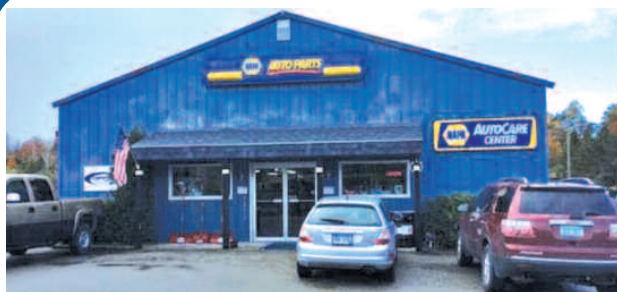
12420 S STRAITS HWY WOLVERINE

Location...Location...Location...Great Business Opportunity, 1.2 miles off I75 in Wolverine, approximately 2 1/2 acres building in very good condition with 2 automotive mechanical bays that brings in additional income. Main part of building is currently an auto parts store. This is a prime location between lakes, hunting and snowmobiling areas of Northern Michigan. This can be purchased and continued to run as is or there are multiple opportunities that would work in this location.. MLS #446474. $89,000. Ask for Mike Stark or Holly Nierman