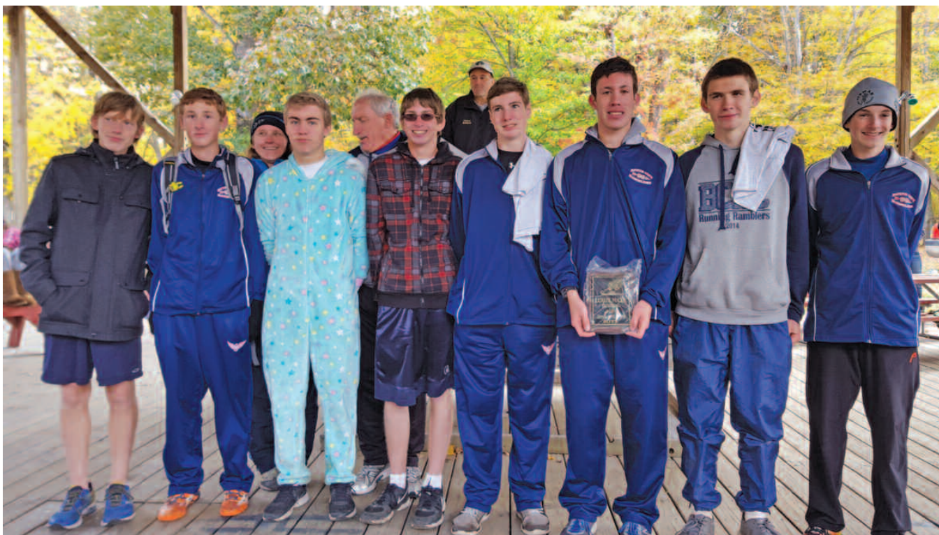
Boyne City boys cross country team earned a runner-up trophy at the Leroy Maxie Memorial Invitational in Fairview on Saturday, October 17.

FAIRVIEW — It started as a white morning for the Ramblers, as Mother Nature surprised us all with a blanket of snow, but the red hot Boyne City cross country team took to the course and when it was all said and done, the Rambler trophy case would have to make room for two more.