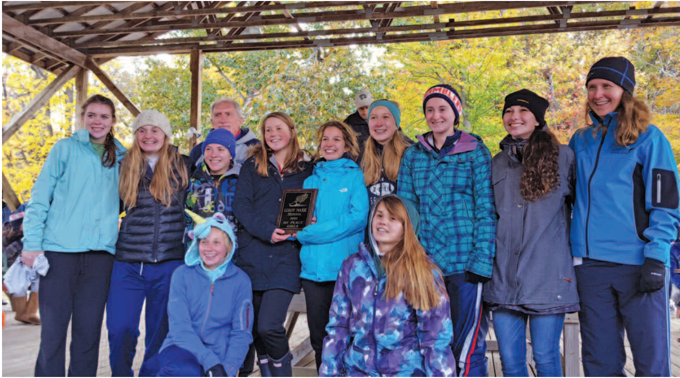
The Boyne City girls cross country team earned a first place trophy at the Leroy Maxie Memorial Invitational in Fairview on Saturday, October 17, placing eight runners in the top 20.