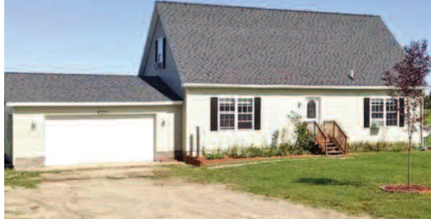
9113 GRAHAM ROAD • EAST JORDAN

Custom built, 4 BR home, on double lot with large storage unit and lots of room for extra parking. Within walking distance of school, town, beach and parks, this well built redwood and brick home has many features rarely seen including quiet, clean, even, hot water baseboard heat. Large, finished basement with 2nd fireplace, bedroom, bath, huge laundry, private entrance offer many options. MLS #445009. $114,900. Ask for Mike Stark or Holly Nierman