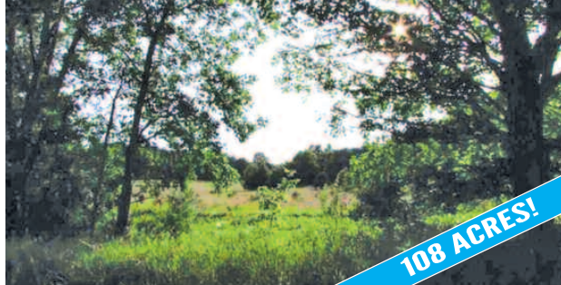
000 OLD GRAHAM, EAST JORDAN

Newer home on 5 acres on the outskirts of East Jordan with a great view and quiet neighborhood. Large master suite with a huge walkin closet on the main, 2 oversized bedrooms on the upper level with separate bathroom. Partially finished basement with egress windows. Poured wall base, nice back deck. Lease option with $10,000.00 down. MLS 446134. $147,900. Ask for Mike Stark or Holly Nierman