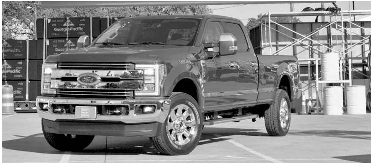
The All-new 2017 Ford F-Series Super Duty, which was revealed at the State Fair of Texas on September 24, is the toughest, smartest, most capable Super Duty yet.