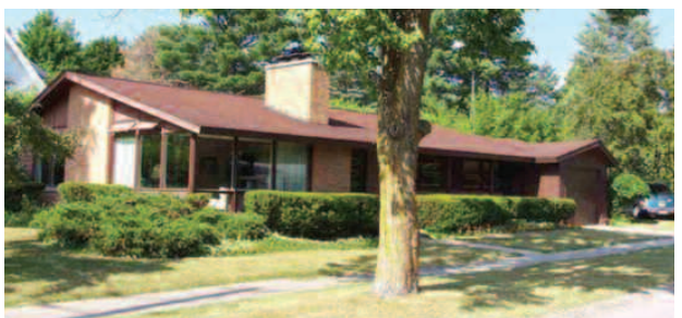
201 DIVISION STREET • EAST JORDAN