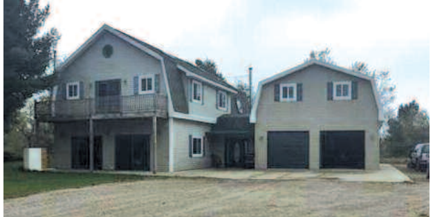
6134 ARTHUR LANE • ELMIRA

A very nice larger parcel that offers a little bit of everything!! Nicely wooded areas and some open fields. The possibilities are endless! Great Hunting in the area. Large enough for that family retreat or hunting camp. Maybe even that golf course or camp ground you have always thought about building. Only a couple miles from downtown East Jordan! MLS 441891. Ask for Chris Oliver. $164,999