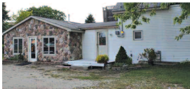
401 WATER STREET • EAST JORDAN

Location...Location...Location...Great Business Opportunity, 1.2 miles off I75 in Wolverine, approximately 2 1/2 acres building in very good condition with 2 automotive mechanical bays that brings in additional income. Main part of building is currently an auto parts store. This is a prime location between lakes, hunting and snowmobiling areas of Northern Michigan. This can be purchased and continued to run as is or there are multiple opportunities that would work in this location.. MLS #446474. $89,000. Ask for Mike Stark or Holly Nierman