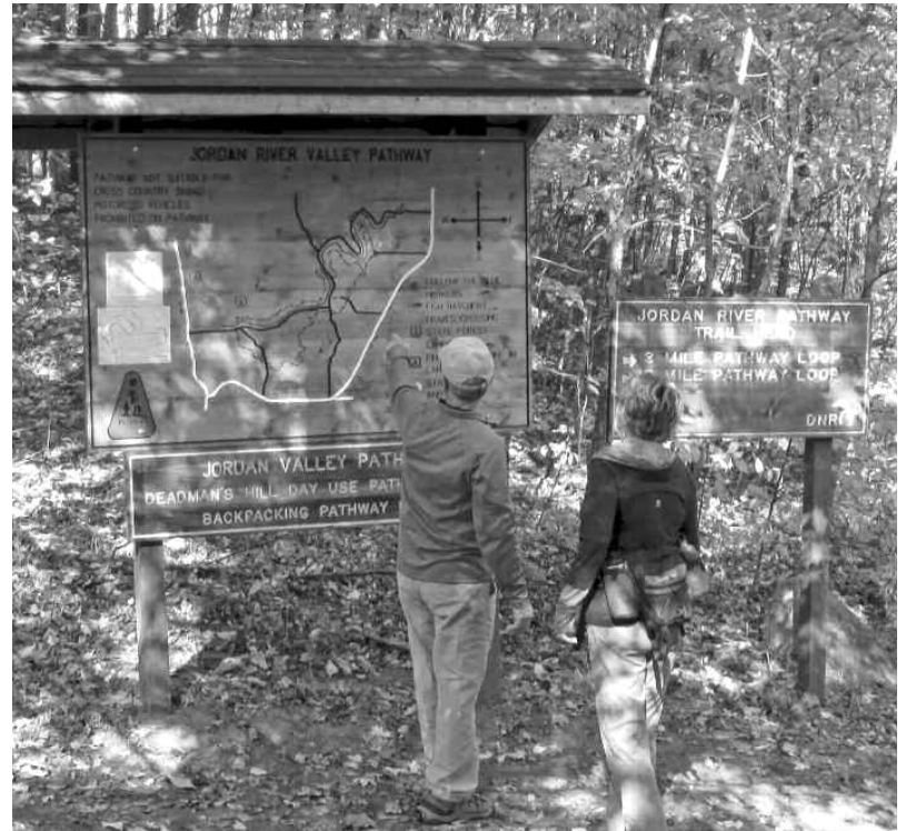
A pair of hikers plan their North Country Trail trek at the Deadman's Hill Overlook trail head near Boyne Falls and Elmira.

Earlier in the summer I rode my bike on the trail from the Wagner Creek access site which is on M-32 west of US-131 on your way to East Jordan. The trail is relatively flat on this stretch and runs through a variety of habitats including forests, meadows, wetlands, and along a pond. On the journey I was delighted to focus on several Baltimore Orioles, cardinals, and an osprey. Therefore, don't forget your binoculars and camera (and plenty of water) on your trek.